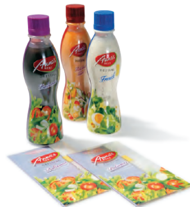
Typical application (shrink sleeves)